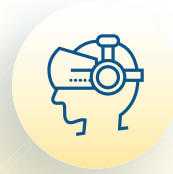
Immersive Reality (AR/VR)