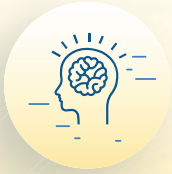
AI & Analytics