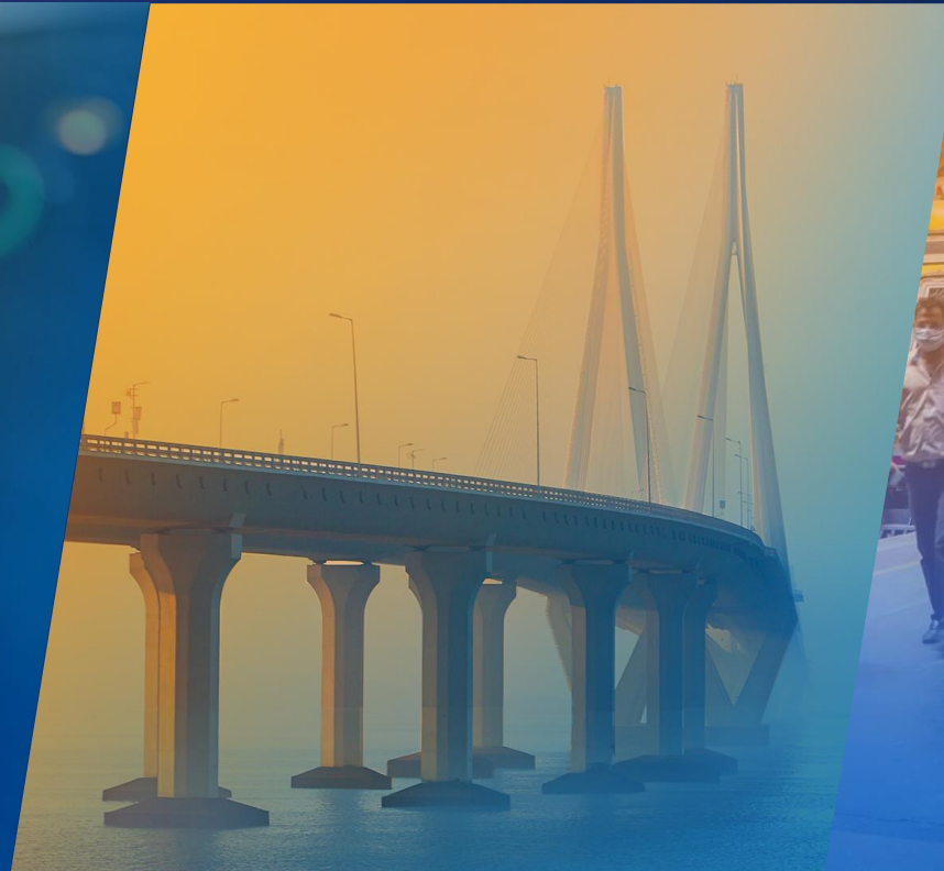
Solving For Insurance innovation