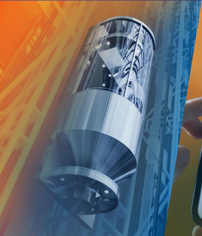
Solving For Smart Elevators